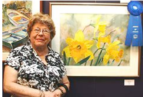
Ann Taylor Award of Excellence