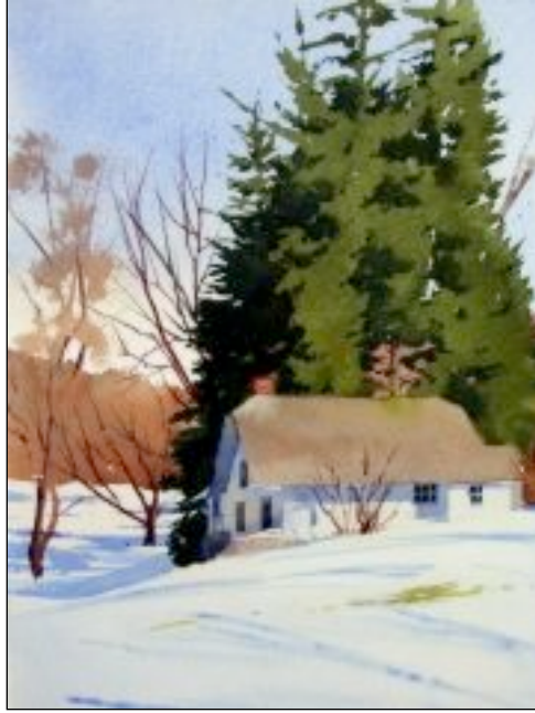
"Mill in Winter"