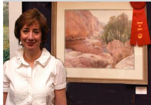
Susan Philips Award of Merit