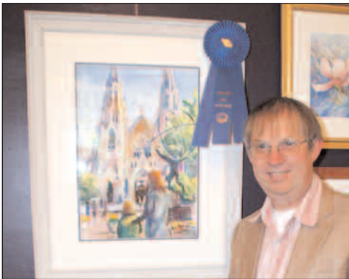
Mark de Mos Award of Excellence