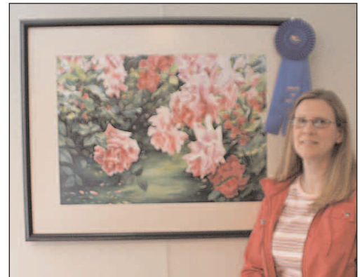
Donna Read Award of Excellence